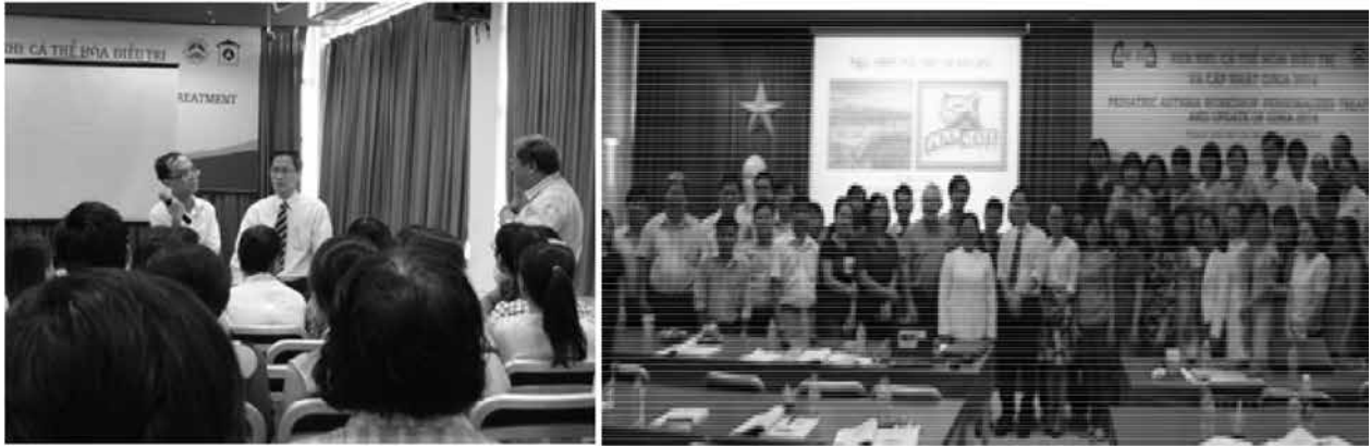
Participation in Practice Guideline Development or relevant review

been representing the APSR in working with the ATS for the Statement on Unproven Stem cell interventions for lung diseases. The APSR has endorsed the 2015 Update version of that ATS Statement by updating it with signatory support from the APSR.