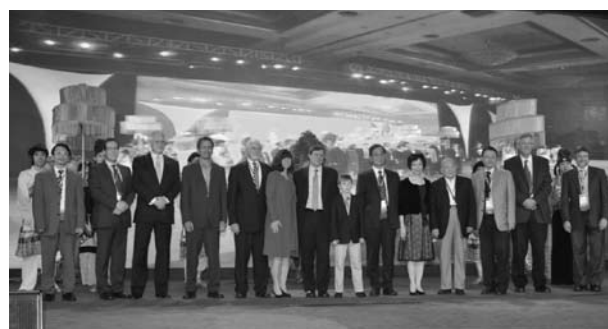
Some leaders of international societies and their guests.