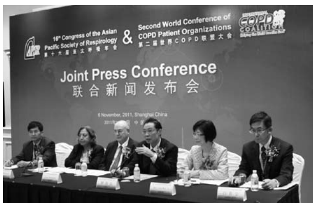
Post-congress press conference