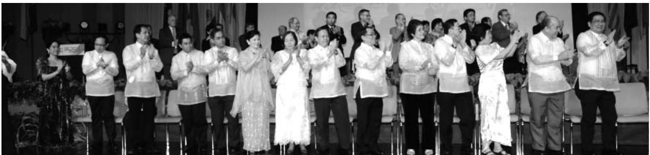
The Opening Ceremony, the 15 th Congress of the APSR, Manila