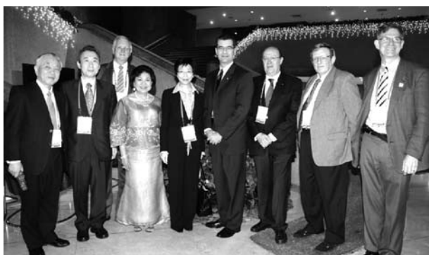
APSR Executives together with leaders of Sister Societies

Hosting the congress for the first time, in the two and half decades of the APSR's existence, the Philippine College of Chest physicians is very much honoured. From the time we won the bid, we set the preparation activities in motion.