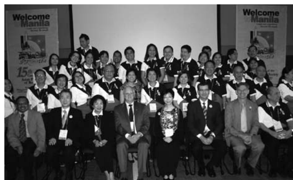
Supporting members of "Year of the Lung" symposium

Invited speakers from the continents of America and Europe were great in not hesitating to come to our country. Despite the economic downturn, our friends in the pharmaceutical and equipment companies were generous in their support. We deeply appreciate all.