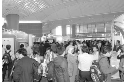
Delegates at the Congress Exhibition Area

The 9 th Congress of the APSR was held from 10 to 13 December 2004 at the Hong Kong Convention and Exhibition Centre, Hong Kong. It was co-organized by the Hong Kong Thoracic Society and the Hong Kong & Macau Chapter of the American College of Chest Physicians, and supported by the Hong Kong Lung Foundation. The Congress turned out to be a great success with over 1,300 delegates from 34 countries and regions. Hong Kong and mainland China