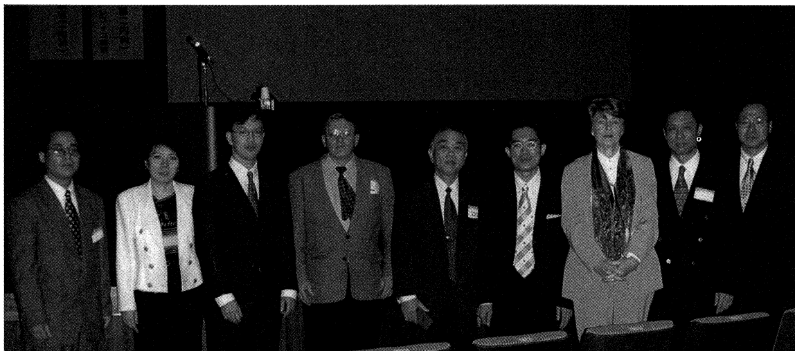
Attendants at the JCS-APSR Workshop at Kumamoto

Lam), structured training programmes in respiratory medicine with annual assessments and exit assessments have started in 16 accredited training centers in Hong Kong.