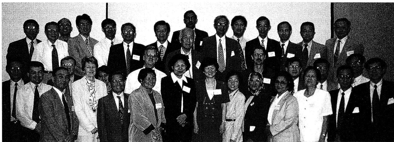
Attendants at the APSR Asthma Guidelines, Workshop

ments on asthma management will be published in a forthcoming issue of the society journal Respirology .